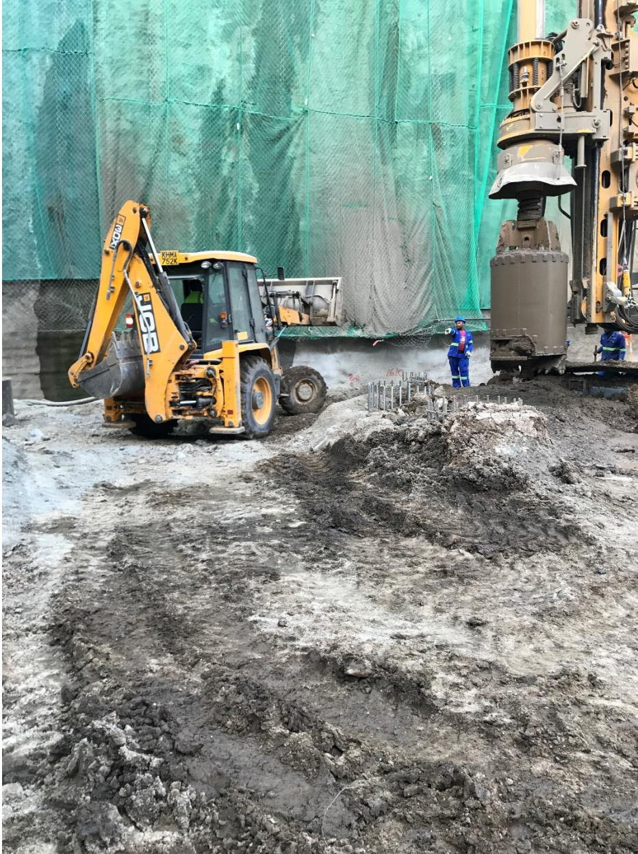
2. Heavy excavation and ground breaking by Excavator